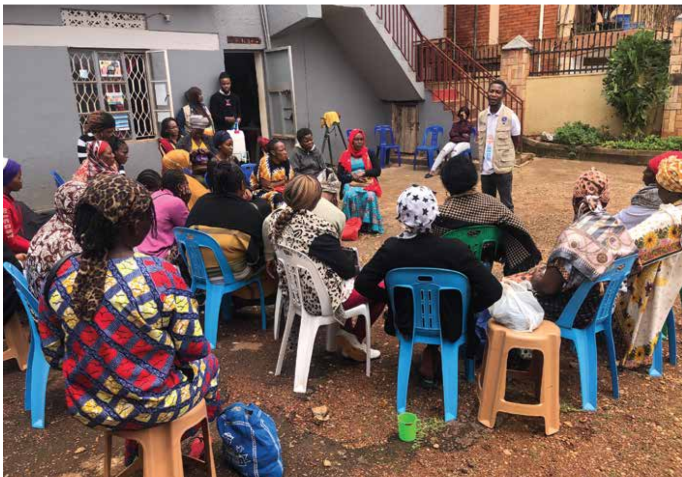
In Uganda Kampala, PPDR hosting a Community information session.