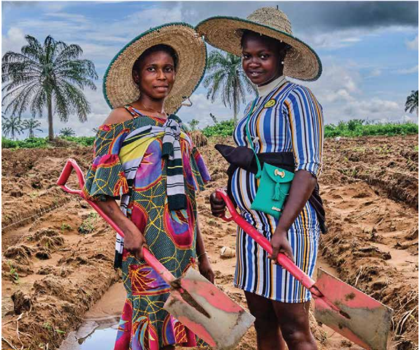
Care for Social Welfare International has helped displaced people in southern Nigeria farm more productively by supporting them with training and solar-powered water pumping.

The inclusion of displaced persons in the humanitarian energy sector is critical in building more effective, holistic, and sustainable responses to humanitarian crises. The Global Platform for Action for Sustainable Energy in Displacement Settings Transforming Humanitarian Energy Access (THEA) programme, in collaboration with the Global Refugee-led Network (GRN), Ashden, and Chatham House, have developed a Strategy Outlook which covers crucial aspects of inclusivity for displaced persons, emphasising the importance of prioritising their participation in the humanitarian energy sector. The Outlook is centred around six key areas, covering inclusion and meaningful participation of displaced communities in policy, workforce, research and innovation, partnerships, systematic change, and investment. The report highlights the challenges faced by displaced persons and supports promoting the agency and involvement of displaced people at the global, national, and local levels, with the overarching goal of enhancing inclusive practices within humanitarian energy policy and programming responses.