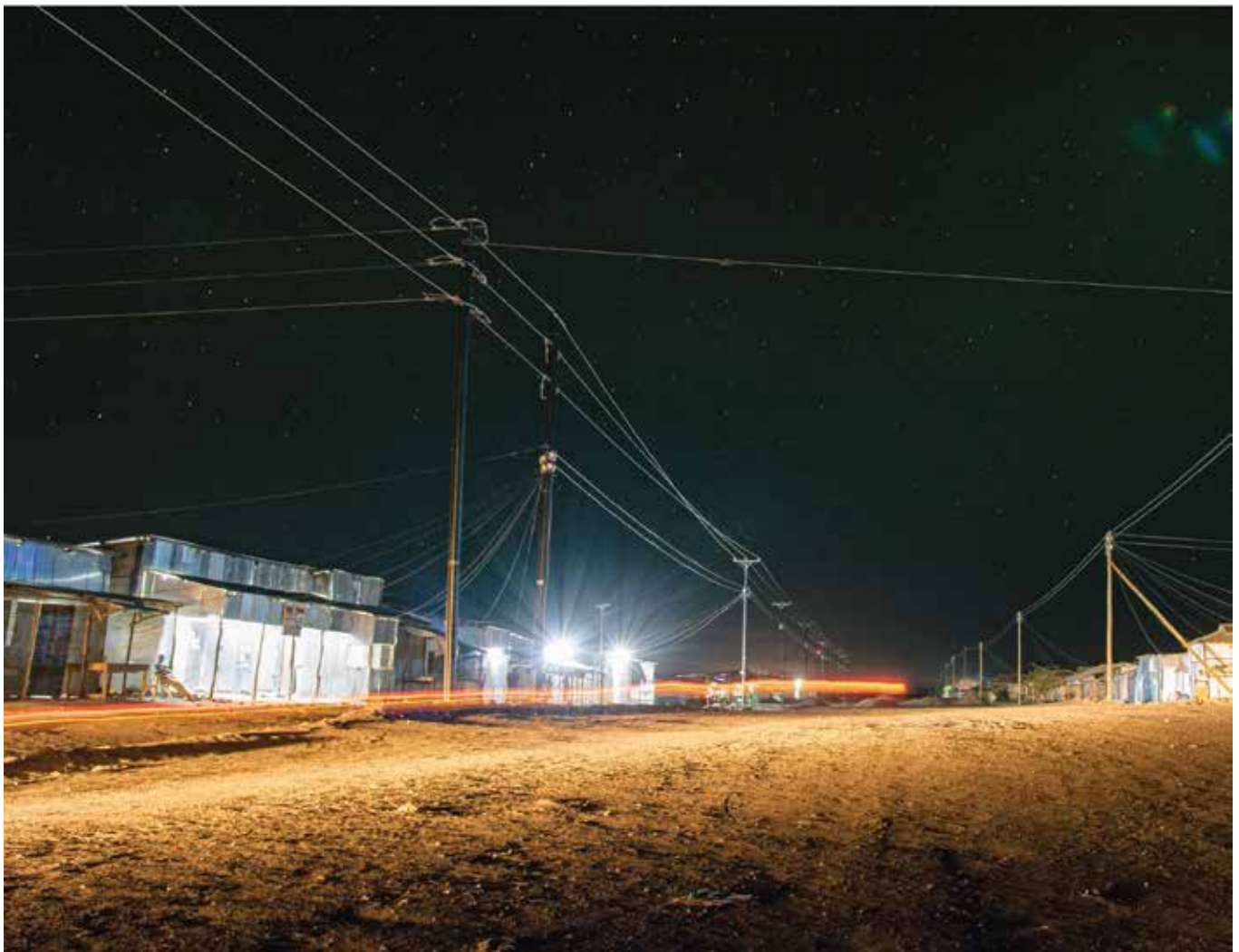
A night view of the streets/walk ways at the recently electrified Kalobeyei integrated settlement villages.

Considering the vital role inclusion plays in reforming humanitarianism and translating its interventions into more sustainable and meaningful programming, particularly in the energy sector, the THEA programme intends to further expand each of the topics outlined above. Over the coming two years, the programme will be developing an in-depth series of strategies based on the above six sub-topics with the aim of paving the way to enable humanitarian energy policy, planning and implementation to become “displaced person-centred”.