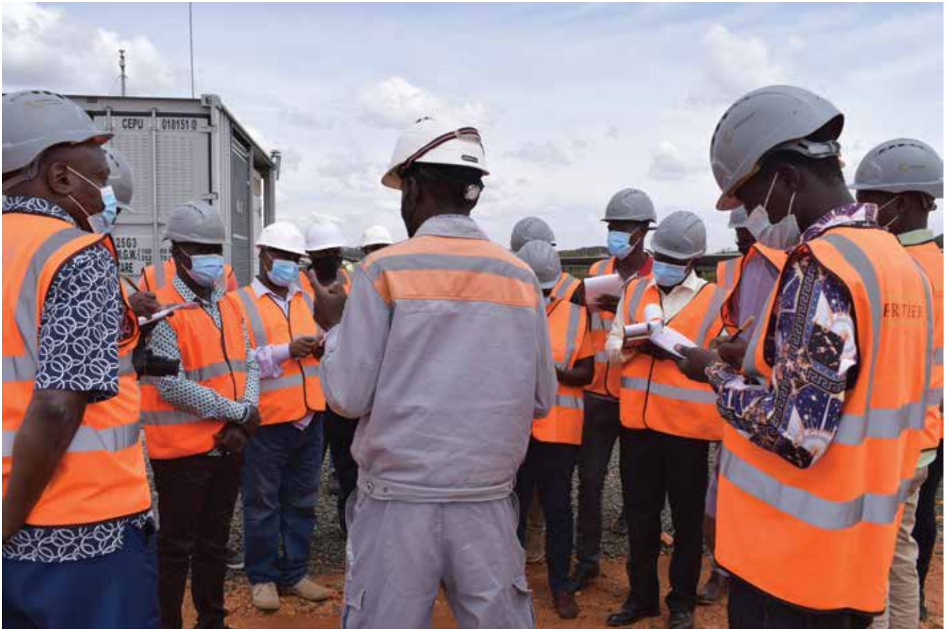
Turkana County Government Officials learning tour of Eldosol and Radiant utility scale solar power plants in Eldoret Kenya.