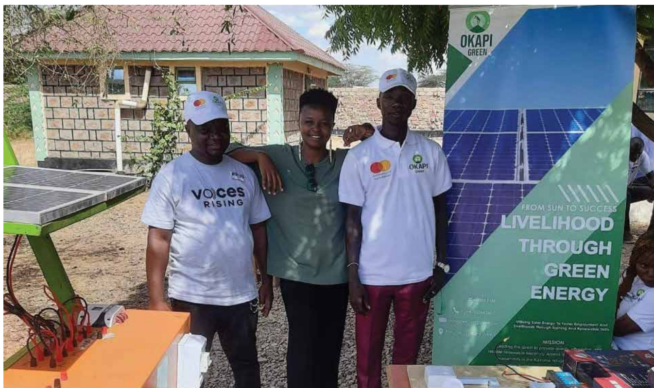
In Kakuma Refugee Camp, Okapi Green provides electricity to households and businesses through solar plans.

Furthermore, displacement settings feature many common barriers, including limited finance, social-cultural impediments, inadequate and inhibiting infrastructure, and legal and policy limitations. To address these challenges, systematic reform is needed to ensure institutional and structural policy barriers are addressed. Particularly, there is a need to adopt a multi-sectoral approach that involves collaboration among governments, international organisations, civil society, the private sector, refugee entrepreneurs, refugee leaders, RLOs and overall community members. This approach should create an enabling environment for energy access by addressing legal, financial, infrastructure, social, political and cultural barriers.