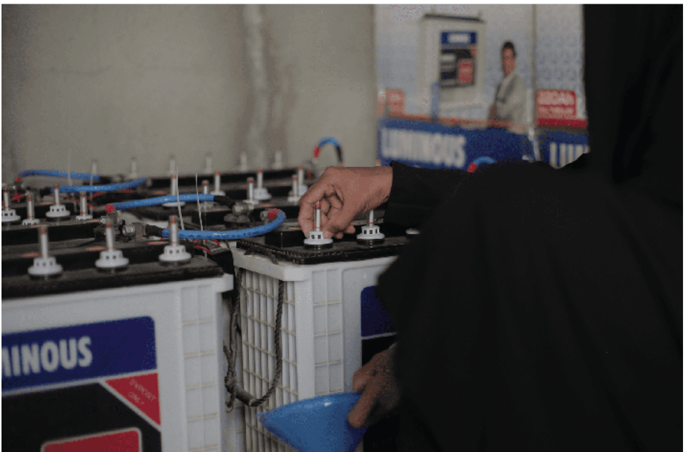
UNDP Yemen has supported displaced people and host communities to set up solar minigrids powering homes and businesses.

One area that needs serious rethinking is the engagement of organisations led by forcibly displaced persons. Current engagements are simply not enough to guarantee sustainable change and development. In many cases, engagement of displaced people is tokenistic. Organisations led by forcibly displaced people can be engaged as co-partners from idea inception to piloting, implementation, monitoring and evaluating. Refugee-led organisations are grounded in local knowledge; their leaders generally encounter the everyday life of fellow displaced persons and know what may work or what may not work for the displaced persons better than many other organisations.