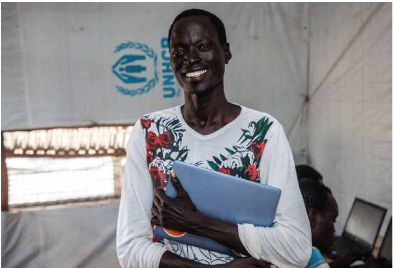
In Kenya's Kakuma Refugee Camp, Kakuma Ventures has set up solar-powered Wi-Fi hot spots managed by camp residents.

THEA programme partners, including Ashden, Chatham House, and the GRN have been instrumental in developing the ideas on inclusive change presented in this report. While focused on humanitarian energy topics, many of the issues presented within the Strategic Outlook can be adapted to other humanitarian sectors. We hope that readers will find it valuable for other humanitarian contexts, recognising the importance of inclusive strategies where displaced individuals take centre stage in determining their future.