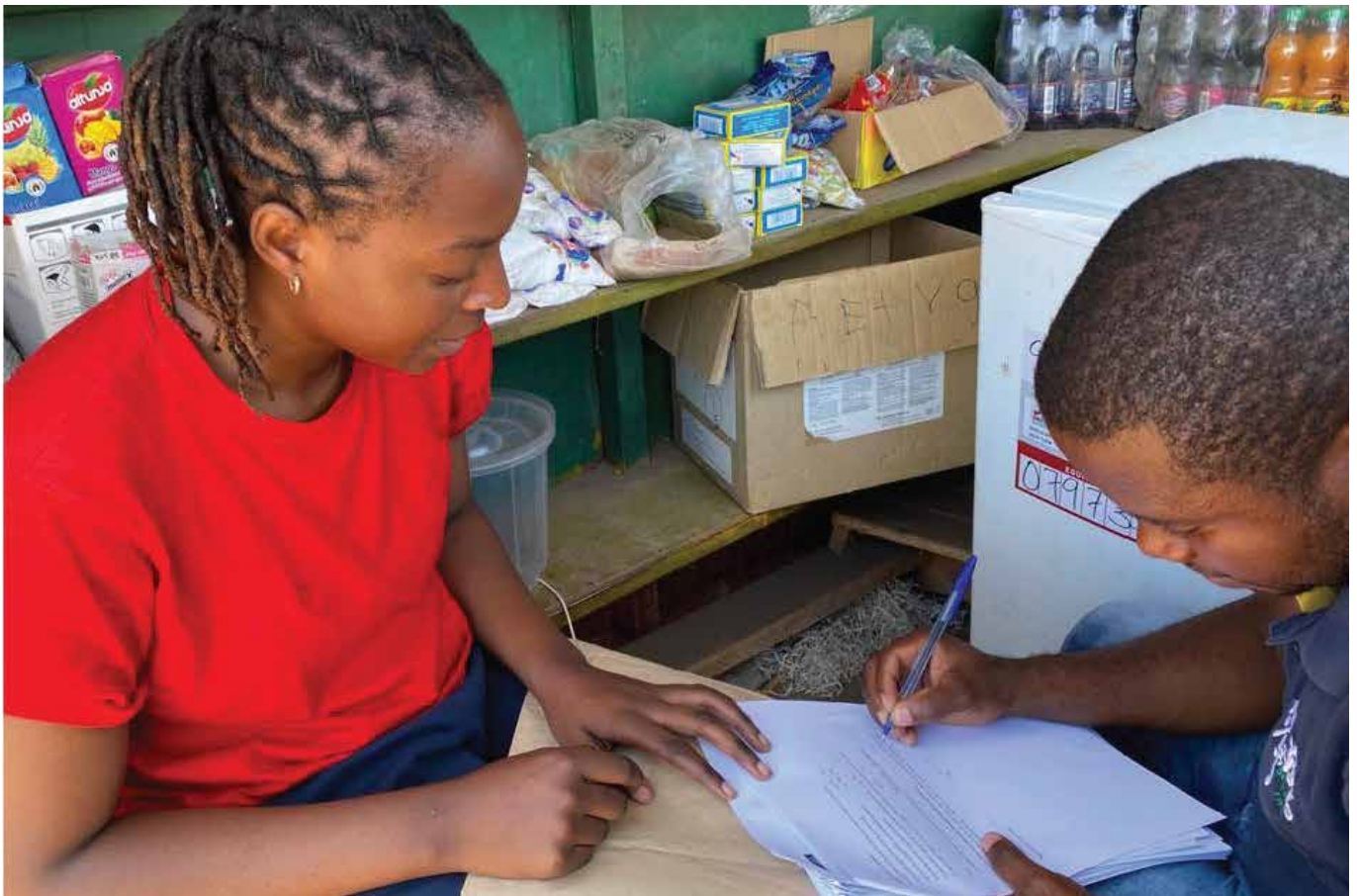
In Kakuma Refugee Camp, research led by refugee on the process of obtaining business and work permit—RLRH research project.