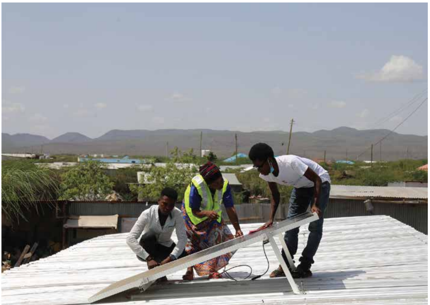
In Kakuma Refugee Camp, Kenya, Solar Freeze provides solar-powered cold storage that helps protect food and medicines. The company is also training camp residents.

Mainstreaming inclusion throughout the six core areas discussed in the Outlook outlines feasible system changes that pave the way for successful sectoral reform- emphasising the ultimate objective of directly involving displaced people in developing solutions. To this end, the diagram below highlights some of the practical recommendations presented in the report.