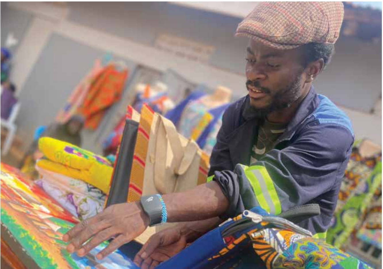
In Uganda Kampala, Youth in livelihood response of PPDR.